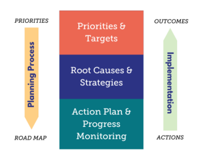
Figure 2: Structure of the UIP

For those transitioning from the old UIP template to the new Streamlined template, the table below offers a crosswalk of some key terminology shifts between the two templates.